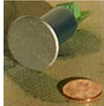
ATS2000A – Uninstalled View

Once powered, the ATS2000A produces two linearly scaled analog signals proportional to temperature when referenced to the COM terminal. Output signals are voltages between zero and +5V. These signals may be conveyed over more than 1000' of cable to the input of a compatible home automation controller or data acquisition system. The ATS2000A is designed to drive all types of shielded and unshielded cables including twisted pair cables such as Category 5.